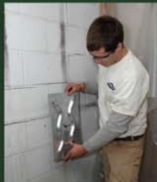
Wall plate is attached to the anchor rod inside the basement.