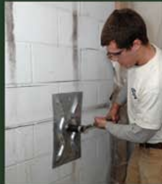
Ball and Socket assemblies are installed and tightened to torque specification.