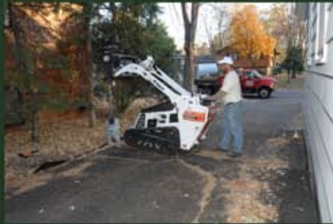
Earth plate is driven into the ground until it meets the anchor rod.