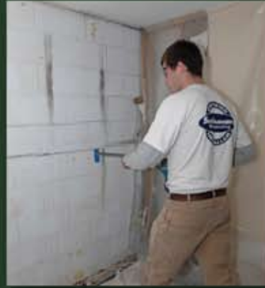
Small holes are drilled through the basement block.