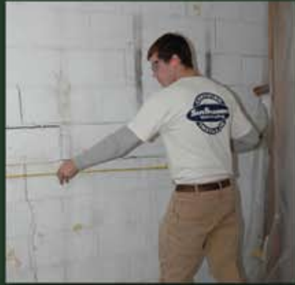
Placement of the wall anchor is determined using careful measurements both inside and outside of the home.