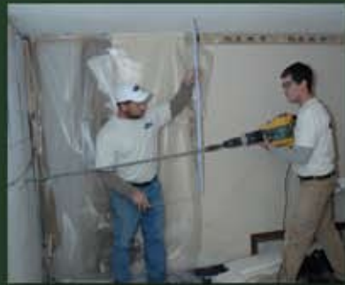
Anchor rods are driven through the block wall and into the soil outside.